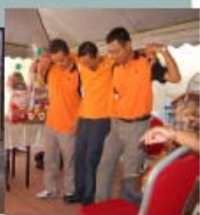
Di antara model-model mangsa kecederaan...masing-masing mempraktikkan ilmu yang ada bagi merawat mangsa yang cedera.