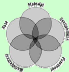
Figure 1: Accident Causation

investigated. Each category is examined more closely below. Remember that these are sample questions only: no attempt has been made to develop a comprehensive checklist.