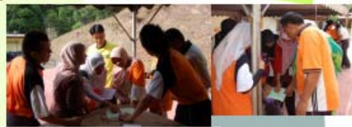
Peserta sibuk mencari jawapan berdasarkan petunjuk yang diberikan semasa program 'treasure hunt'